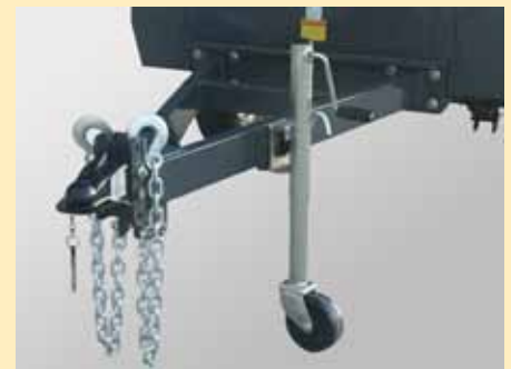
Greater Towing Stability — A wider stance, 14" tires, a re-engineered lower center of gravity, heavy duty leaf springs and a rugged "A" frame draw bar provide even greater strength and stability when towing.