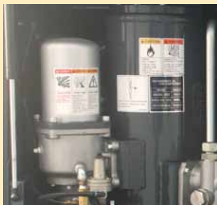
Externally Mounted Separator Filter — Located exterior to the tank and easily serviced by hand for decreased maintenance costs and downtime.

Lockable gullwing doors and lockable control panel cover; LED tail lights provide increased towing visibility in all weather conditions and are enhanced by multiple side and rear reflectors.