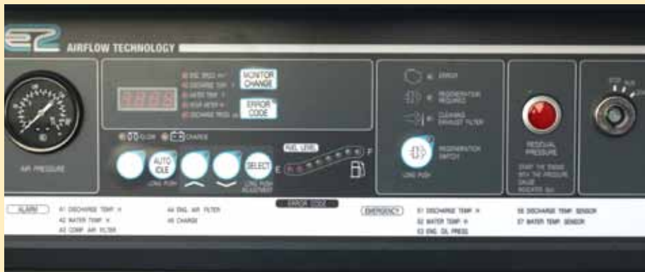
Diagnostic Control Panel — Monitors low fuel level, battery, fuel filter, engine oil filter, water temperature, compressor air filter, oil pressure, discharge air temperature and auto idle.