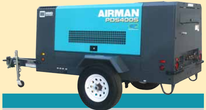
PDS400S-6C3 400 scfm • Tier 3 Flex Isuzu Diesel Engine